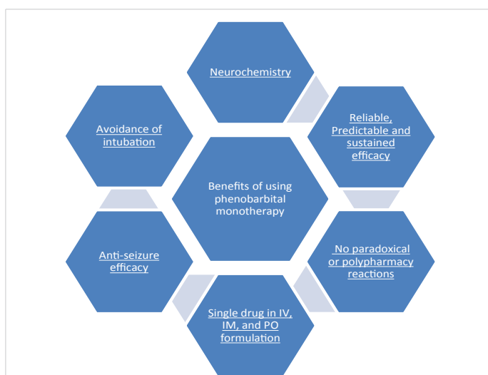
Figure 1: Benefits of using phenobarbital monotherapy in AWS.

effects especially signs of hepatic coma. Lower doses should be safe but if higher doses are used there is risk for hepatic encephalopathy, monitoring for hypotension and bradycardia besides other parameters is advised. Most heavy drinkers have steatosis or steatohepatitis. Only 10-15% end up with cirrhosis [16-18]. That leaves us with good 85-90% patients with hepatic impairment who can benefit