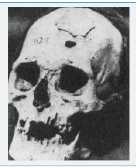
Figure 5: Peruvian skull from 2000 BC, has a left frontal defect, which was covered with a 1-mm-thick plate of gold.