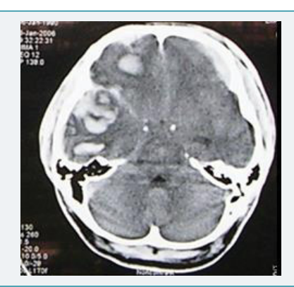
Figure 1: Computed tomography (CT) scan brain (axial view) showing right frontotemporal acute subdural hematoma with left frontotemporoparietal acute subdural hematoma.

He underwent bilateral craniectomy with evacuation of clot. Post-operatively he was cerebral protected. A repeat CT scan brain (Figure 2) was done showed residual