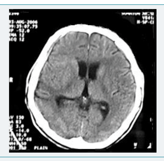
Figure 4: Computed tomography (CT) scan brain (axial view) showing no extraaxial collection, no enchancing lesion, no midline-shift, with encephalomalacia over right temporoparietal area. The sulci and gyri are well-visualised without any effacement.

For centuries, cranioplasty has relied on the process of osteoconduction. In this process, the bone graft provides the three-dimensional structure to allow surrounding